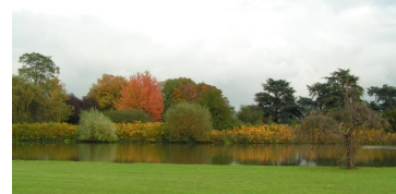
The Great Lake, Welbeck

Send copy to the Editor: jeff.hobson.jh@gmail.com 01636 705853