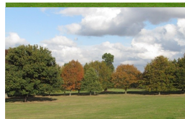
Wollaton Park, Nottingham